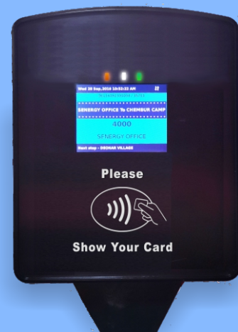
Auto Fare Collection System