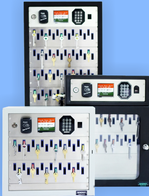
Key Management System

Driving customer's success via innovative electronic solutions.