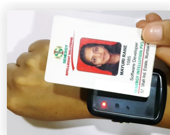
Wrist Mount RFID Reader