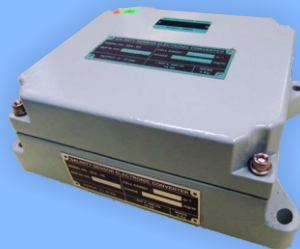
MIL Qualified Salinity Transmitter